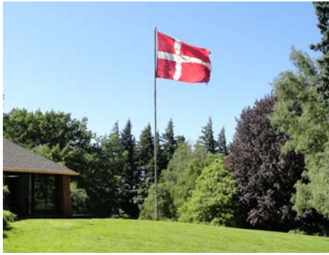
Dannebrog flying at the Danish Cultural Conference.