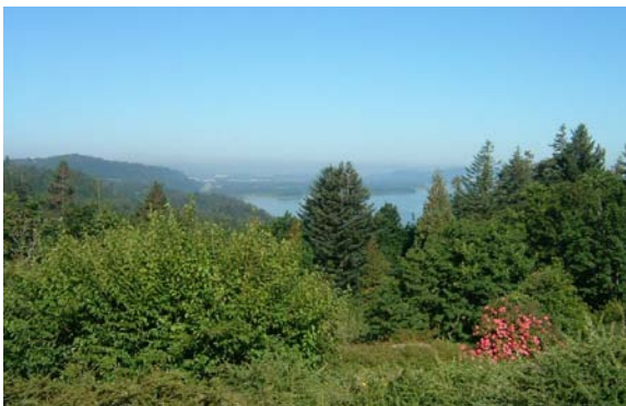
The view west from Menucha Retreat and Conference Center