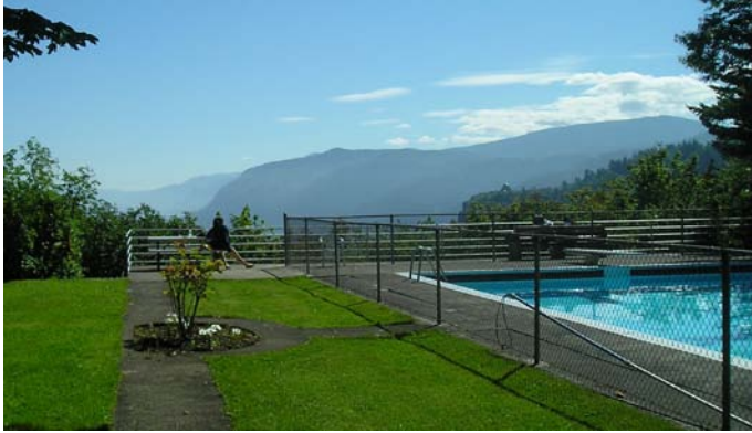
Poolside at Menucha with Vista House in the distance.

sample the highlights of Scandinavian architecture along with a visual survey of European architecture through the ages.