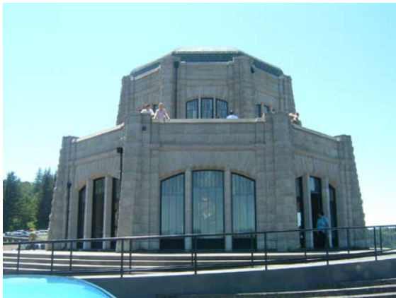
Vista House at Crown Point, and the Columbia Gorge