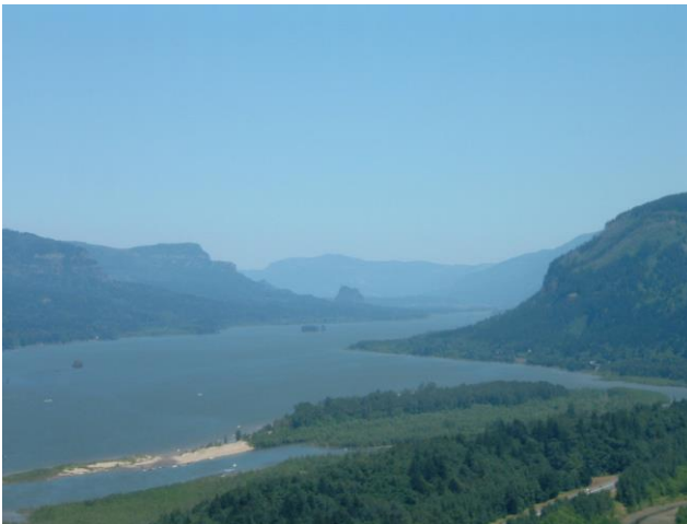
Columbia Gorge and Signal Rock from Menucha

Have you trained your body to perform faster, stronger, better? Have you been part of a team, working together to compete? Have you cheered for a team that connects you to your home or your school? The Museum of Danish America celebrates all of these aspects of Sport in the exhibition "Sport for Sport's Sake: Athletes and Ethnicity in Danish America." Many amazing stories from the museum's collection is featured and the new exhibition is focusing on Danish-American sports such as gymnastics, tug-of-war, swimming and bicycling. In the process of developing this exhibition we worked with four aspects of sport: Fitness, Competition, Camaraderie, and Profession.