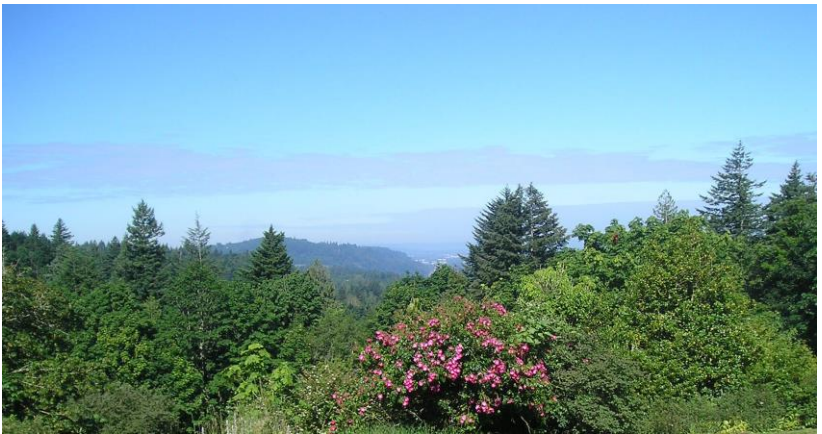
Some of the beautiful roses at Menucha