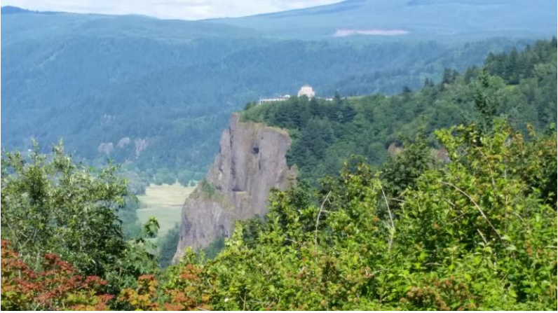
View of Vista House at Crown Point from Menucha