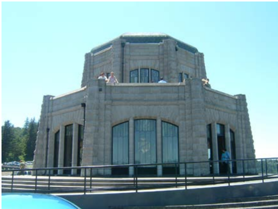
Vista House at Crown Point