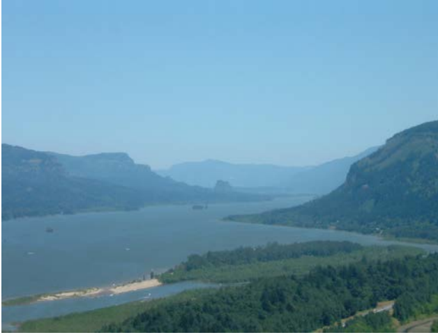
Columbia Gorge and Signal Rock from Menucha