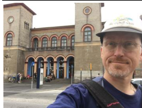
Photo: Jan Bruun-Petersen in front of Roskilde Festival participants with their camping gear on the steps of the train station

Thirty miles west of Copenhagen is the city of Roskilde that has been around since the age of the Vikings. The gothic cathedral from 1275 houses the 39 tombs of the Danish monarchs. Up until the church reformation, Roskilde was also the capital of Denmark and where the coins were minted.