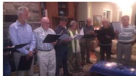
Image: Danish song group in Oregon

On September 26, a happy group of Danes enjoyed a great time singing many beautiful Danish songs, this time accompanied by three talented musicians. The 23 participants had a