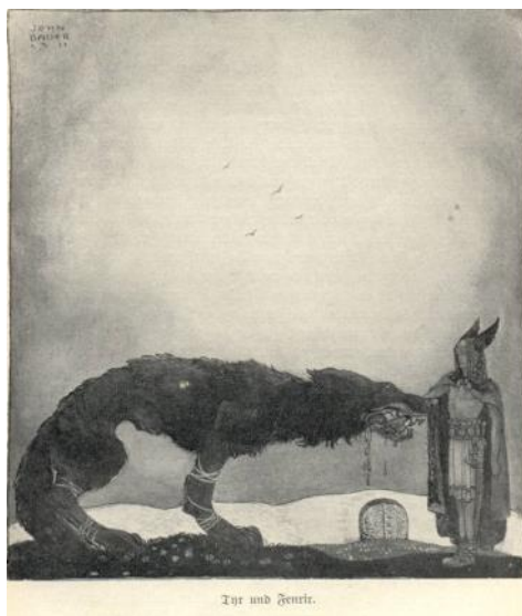
Image: Fenris and Tyr

"When the gods saw that the wolf was sufficiently well bound, they took the chain which was fixed to the fetter, and which was called Gelgja, and drew it through a large rock which is called Gjøl, and fastened this rock deep down in the earth. Then they took a large stone, which is called Tvite, and drove it still deeper into the ground, and used this stone for a fastening-pin. The wolf opened his mouth terribly wide, raged and twisted himself with all his