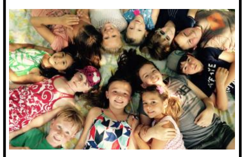
Ages 5-10 August 5th to August 9th 2019 Seattle Danish Center

2019 Theme: Danish Castles Register by July 9th 2019 for the lowest price! www.northwestdanish.org/danecamp/