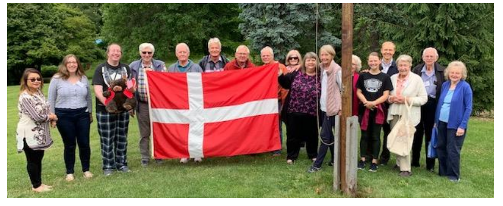
Image: A group of 2019 DACR attendees with the Danish flag—the flag is now 800 years old.

A PUBLICATION OF THE NORTHWEST DANISH ASSOCIATION