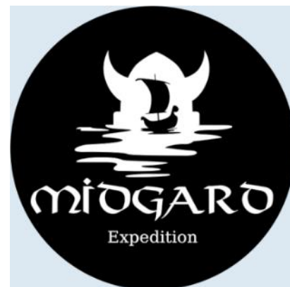
Image: The Midgard Viking Expedition Logo