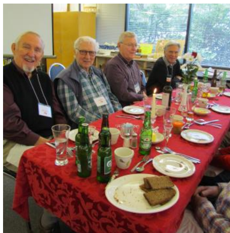
Image: Our NWDA members enjoying lunch at the Seattle Danish Center followed by a slideshow of old memories

"I thought you might like to know that it was a real struggle to close the building we owned in South Park, but that is nothing new for the