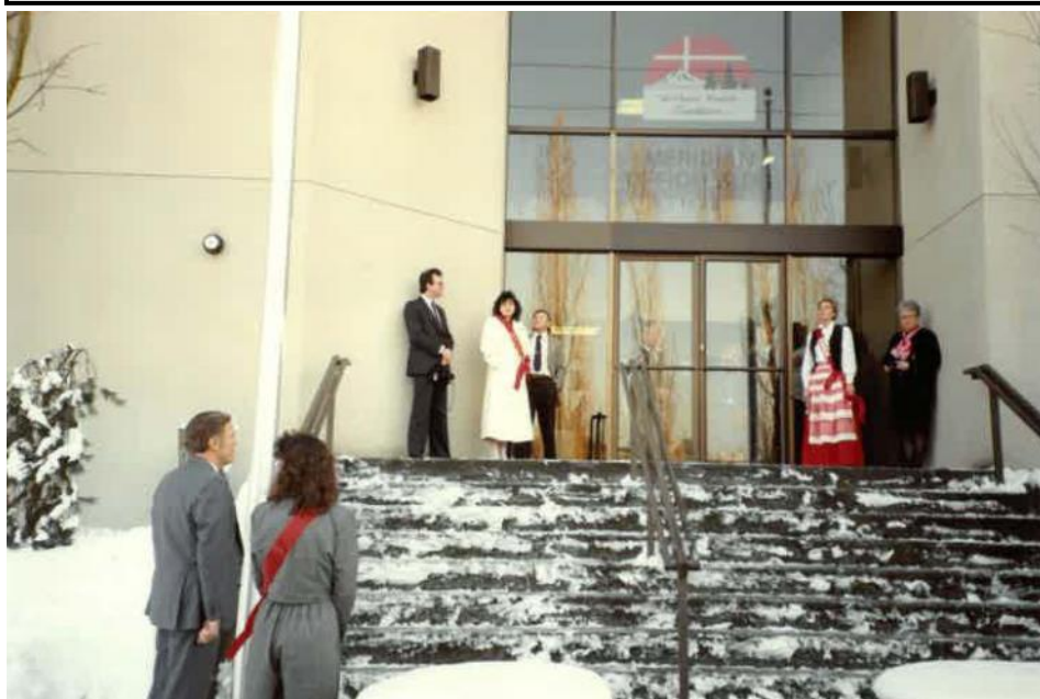
Image: NWDA building dedication ceremony on February 17th, 1990

Think back to February 17 th of 1990. It was a snowy day in Seattle. Just a couple of weeks earlier Punxsutawney Phil did not see his shadow, but the city still seemed to be stuck in the middle of winter with no spring in sight despite his predic-