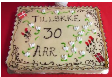
Image: NWDA's building anniversary cake from Larsen's Bakery

The Danes are resilient people. No matter our hardships, we find a way to keep going and support each other. We have celebrated thirty years in this home and I am ready to celebrate many, many more. Mange tak to everyone who has made this organization what it is today. Who saw the needs of the Danish community in the Pacific Northwest and changed and grew as the needs changed and grew.