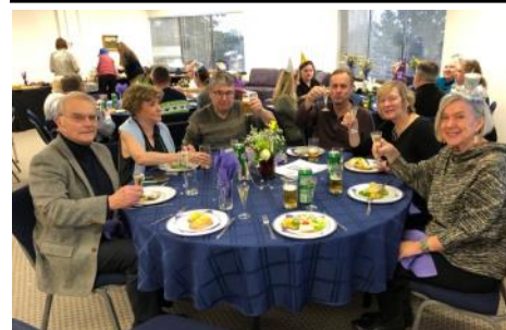
Image: Guests raising a toast at the DAVS New Year Luncheon

January 4, 2020 - For many years we have called our annual luncheon "DAVS". It is a fun name that stands for "Danish American Vintage Society". We used to have these luncheons in December, so of course they were Christmas luncheons, but everyone got so busy in December that we moved them to January, so for several years now we have had New Year's Luncheons. It turned out that it is a perfect time for the NWDA community to get together, and it is very popular.