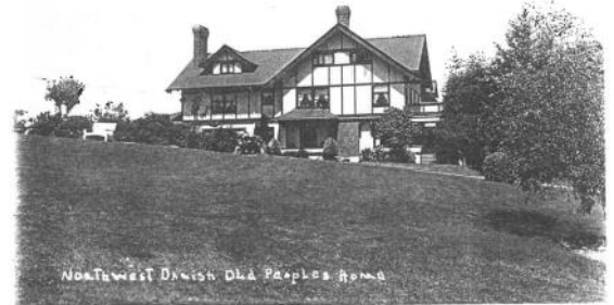
Image: The original Northwest Danish Old Peoples Home opened in 1924 after the organization was incorporated in August 1923. This building was demolished in 1969 to make way for a new facility on the same property.