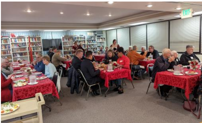
Image: Members and guests at the Annual Dinner after the Meeting

As COVID restrictions have eased, we have revived some in person events in the last quarter of 2022. One of these events was the Annual Membership Meeting and Dinner. It was hosted a month later than has been typical to allow enough time for planning. There are a lot of little, and big, pieces that make up the Annual Meeting and Dinner. The agenda must be set, along with each piece being handled by different board members and staff. Set up, technical challenges, and paperwork can be time consuming in order to be prepared. Dinner is another, albeit related challenge.