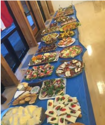
Image: New Year lunch at Nordia House

kost. It is an old tradition here, and DAVS stands for “Danish-American Vintage Society”. It is probably the most popular and well attended event each year. Each person brings five slices of Danish smørrebrød, most on Danish rugbrød and using the typical ingredients, such as herring, leverpostej, roast beef, ham, shrimp, salmon, frikadeller, cheese etc. The smørrebrød is decorated with suitable toppings and enjoyed with the usual Danish drinks, such as beer and aquavit. We line up the food in proper order, first seafood, then meats, and finally cheese and/or fruit salad. (See illustration). As usual, we started the year with this feast, and the great room in Nordia House