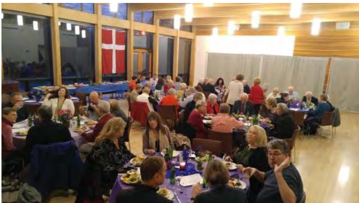
Image: New Year lunch at Nordia House

Are there any of our members who don't enjoy smørrebrød? Probably not, so every year we start with a big smørrebrød "DAVS" Nytårsfro-