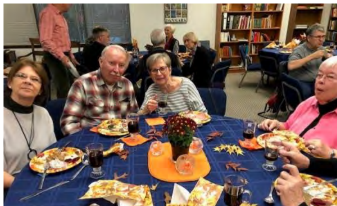
Image: Glogg Party at Danebo

Another activity that is perhaps unique for the Portland group is the Danish Book Club where we all read Danish novels in the original language and also discuss them in Danish. Of course most of our members are native Danes, but lately we have acquired several active members who have learned Danish as adults, which is really admirable. Five of our current members are not native speakers, but read the novels and participate happily in the discussion. Sometimes it is difficult, but they persevere!