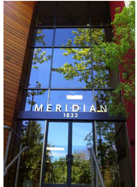
Image: The NWDA Building in Seattle

The Seattle Danish Center is in Suite 205