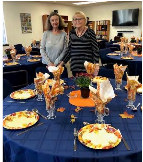
Image: Glogg Party at Danebo

In February we launched a new venture, which is proving to be very successful: A Danish Conversation Group, which meets twice a month, on the second Monday at 12:30 - 2:00 pm, and the fourth Monday at 7:00 - 8:30 pm. In this way, it is possible for those who don't drive in the evening to meet in the afternoon, and those who work day time jobs to meet in the evening. For the first two meetings we had 11 participants each time - not all the same 11 - and everyone had a great time. Most of them know some Danish, but we had all levels from beginners to native speakers. There is no pressure to speak, but all have a chance to participate at their level, and only if they indicate that they want to be corrected, do we comment on their grammar or vocabulary. It was great to hear that everyone encourages those who struggle to find the right