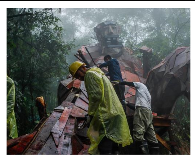
Images: Working with Volunteers to build trolls

September 17th. The sculptures will be hosted at each site for at least three years. Fashioned entirely out of recycled materials, the large-scale public art installations tell a tale of protecting nature and honoring the land and waterways. With a focus on understanding the impact of humans on life in watersheds and animal habitats, the project includes a companion story focused on restoration and preservation of riparian habitats in an approachable, fun way. It provides opportunities for youth and adults alike to learn, support, and make a