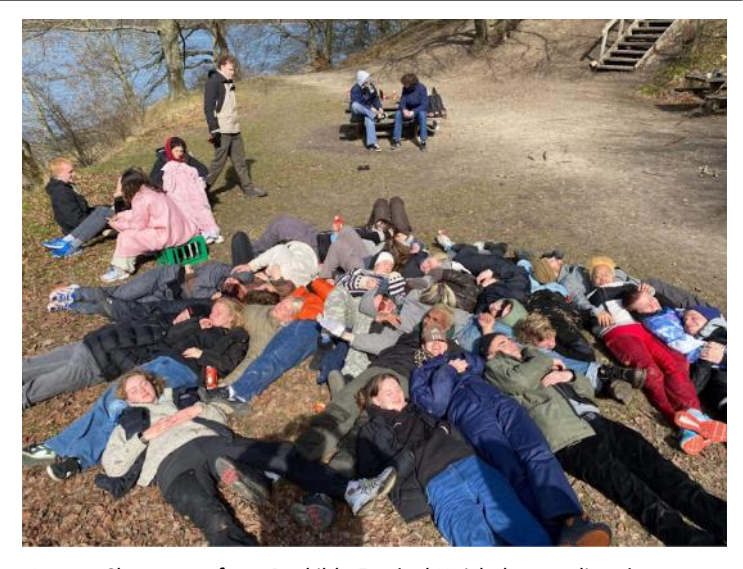
Image: Classmates from Roskilde Festival Højskole spending time together in the sun on nature days in the forest with no technology.

Which is a special sentiment, to develop a new sense of intuition that has been mine to create and shape. Espe-