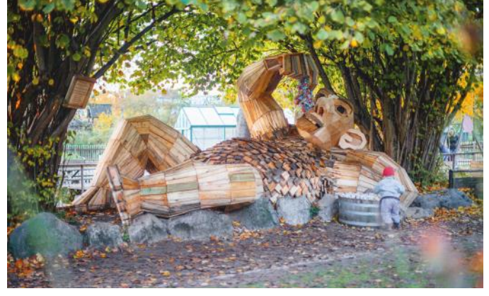
Image: Sutte Trolden Sanka (Pacifier Troll) Copenhagen, Denmark