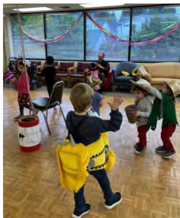
Image: Children enjoying their rasler at Fastelavn

Then all the kids gathered on the dance floor to hear the story of Fastelavn before lining up just outside for the costume parade. They all had their fun costumes and carried their rasler they had decorated earlier and collected coins from the grown-ups around the room while singing "Fastelavn er mit navn". Since their rasler were made of recycled coffee cans, it got quite loud in