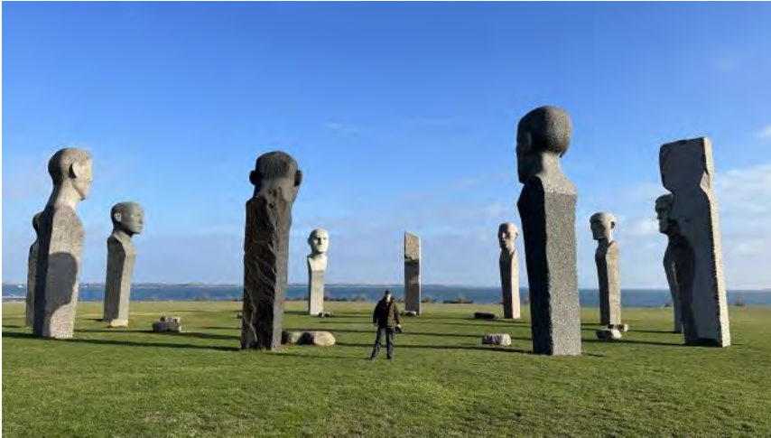
Image: Jan Bruun-Petersen is dwarfed by the towering presence of Dodekalitten.

On the island of Lolland near the harbor town of Kragenæs is a design of 12 sculptures standing in a 40 meter diameter circle that combined with music, history and geography create a new landmark to experience. The project started in 2010 and should be completed in 2025. The sculptures are outside between the sea, the forest and farmland. So no cost of admission to enjoy them. From the sculptures, one can see the islands of Fejø and Femø. Lolland is one of Denmark's largest islands but unusually flat, due to sinking at the end of the last ice age. I did some work with a local band with Lolland roots that called themselves Lowland.