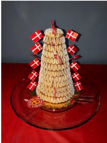
Image: Kransekage from Larsen’s Bakery donated by ScanDesign Foundation

The whole world sat up and listened during the Queen’s traditional New Year’s Eve speech. This year her speech