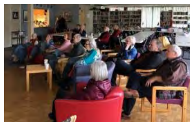
Image: Watching Danmarks Radio about the abdication

those who joined us, despite some icy weather, to celebrate a momentous occasion in the history of Denmark and the world.