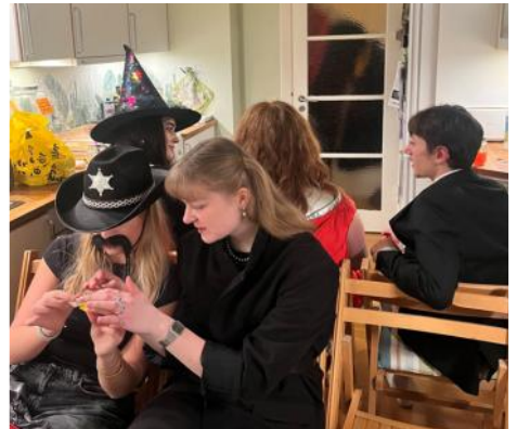
Snapshot from a Lego building competition during our fastelavns party

At 21, I am both excited for who I am becoming and sentimental about who I have been. In the early March breeze, hints of a ripening spring are everywhere—the sun is more hesitant to go to sleep, branches begin to burst with color, and the sky shakes off its grey residue. As the earth begins to grow and take shape, so do I.