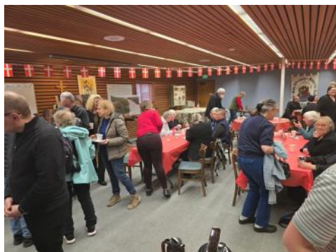
Image: Concert attendees at the reception

Mange tak to the volunteers who made this possible! If you are interested in more concerts in this series, please visit https://nwegrieksociety.org/nordic-chamber-music-2024-2025/ .