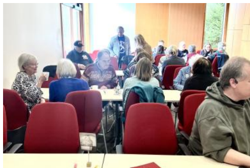
Image: Beginning of Coffee Hour

NWDA hosted the February Noridic Coffee Hour at Nordia House. Each month, on the fourth Tuesday, a different Nordic partner organization to Nordic Northwest Hosts.