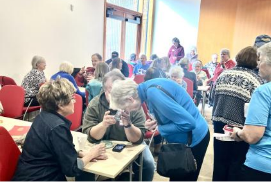
Image: Coffee Hour at Nordia House on Feb. 25th

With spring just around the corner, today was a sunny day in more ways than one. As the rays of bright light cut through the windows at Nordia House, the Northwest Danish Association celebrated the coming season with a festive coffee hour.