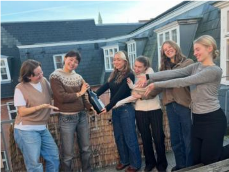
Image: Previous campaign volunteers handing us the a gammel dansk bottle as a tradition of passing over the responsibility of the Operationdægsvarv campaign

On March 1st, I turned 21, officially crossing the abstract line into "adulthood." Now, I find myself dancing with a bittersweet alchemy of celebration and reflection.